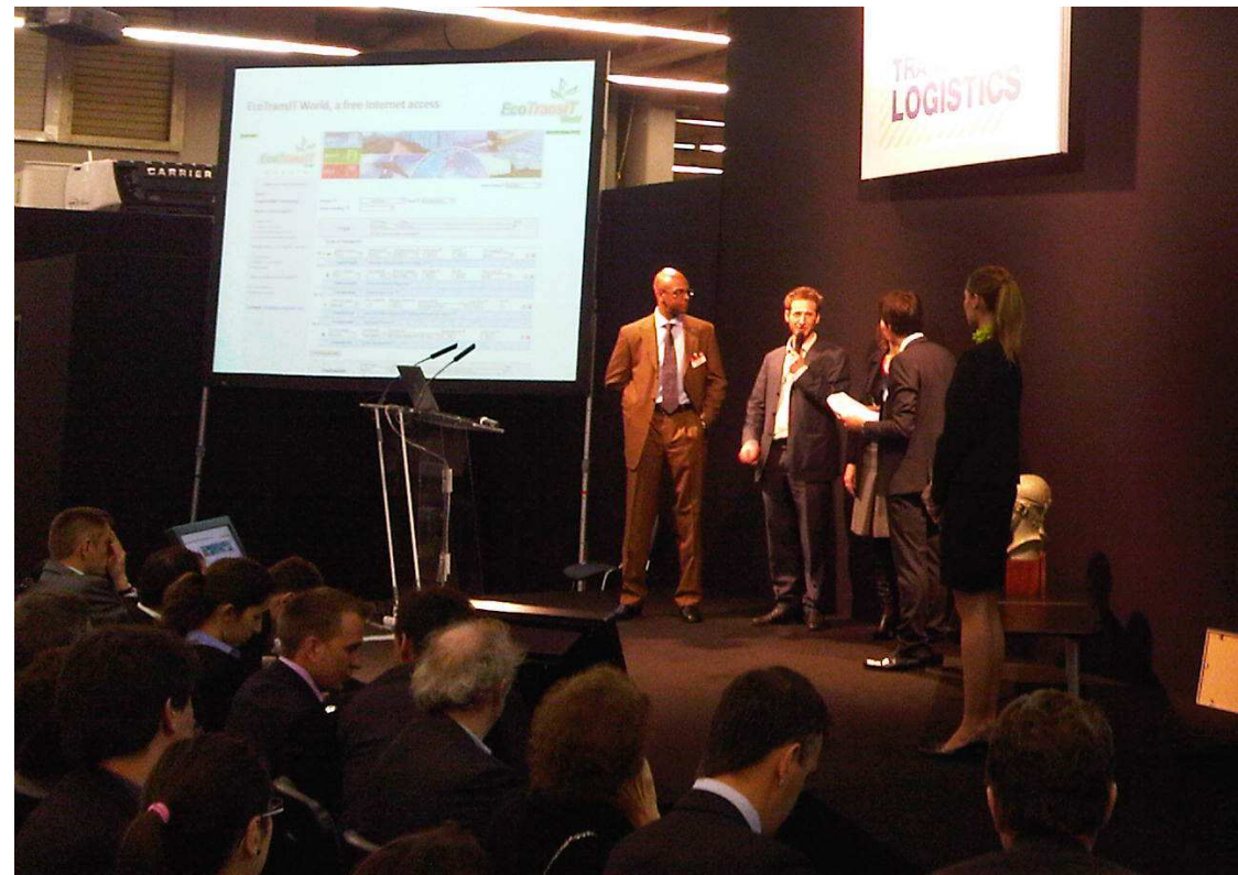
SITL, Logistics Solutions | From 29 to 31 March 2011 | Pavilion 7.2, Paris, Porte de Versailles